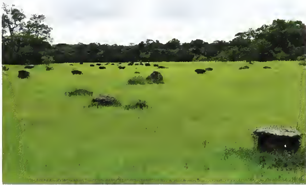
Figure 4. Seasonal grasslands on lateritic soils ( boue ) and forest patches cover the plateau of Dindéfello Nature Reserve, Senegal, September 2011 (N. Ruiz de Azua) Des prairies saisonnières sur cuirasses latéritiques ( boue ) et des parcelles de forêt couvrent le plateau de la Réserve Naturelle de Dindéfello, Sénégal, septembre 2011 (N. Ruiz de Azua)

the mountain slopes is characterised by Bombax costatum , Vitellaria paradoxa , Combretum glutinosum , Ficus sp., Nauclea lautifolia , Parkia